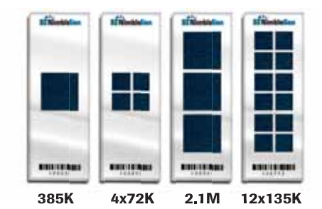
Multiple microarray formats available for analysis of a single sample, or multiple samples per slide.

Visit us online or call: www.nimblegen.com/cgh (877) NimbleGen / (608) 218-7600